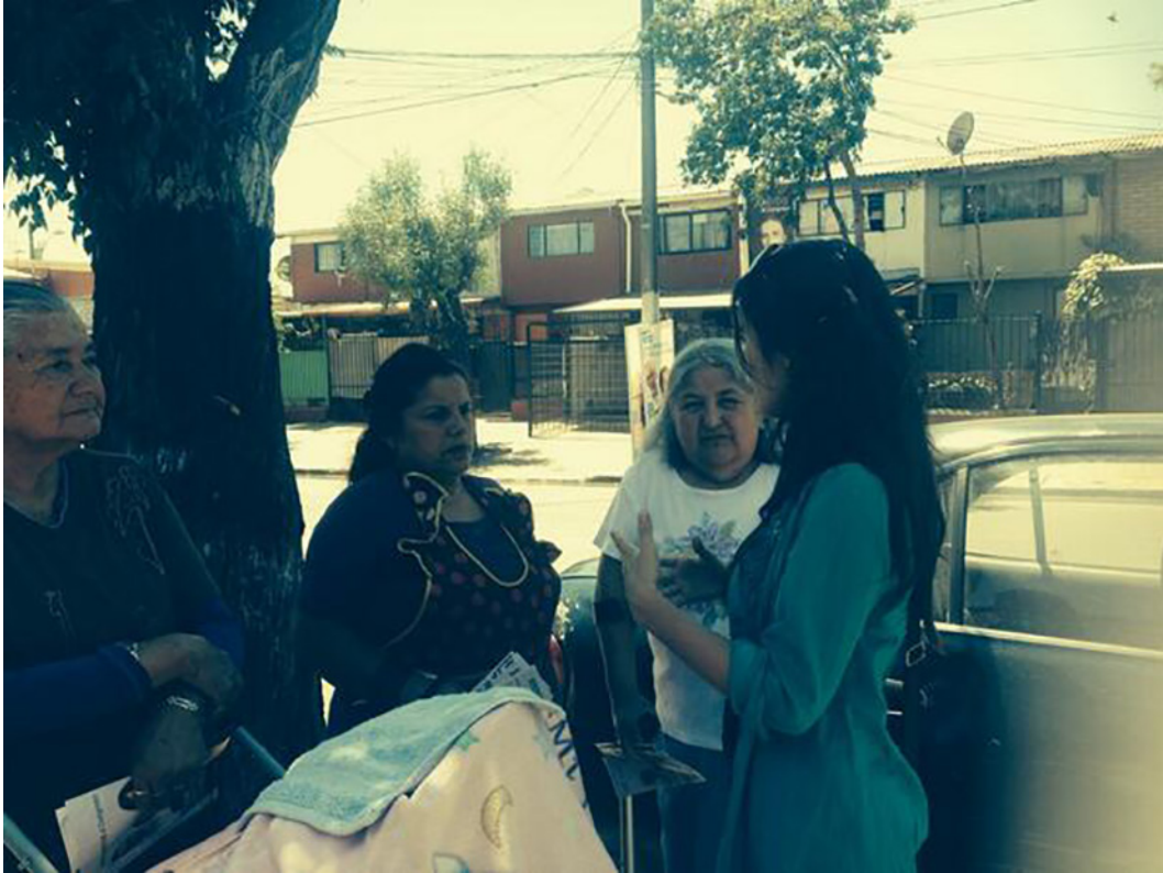
Image 1. Electora campaign of Camila Vallejo.