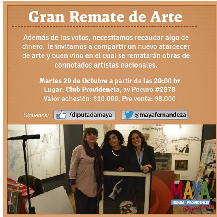
Image 2. Electoral Campaign of Maya Fernández.