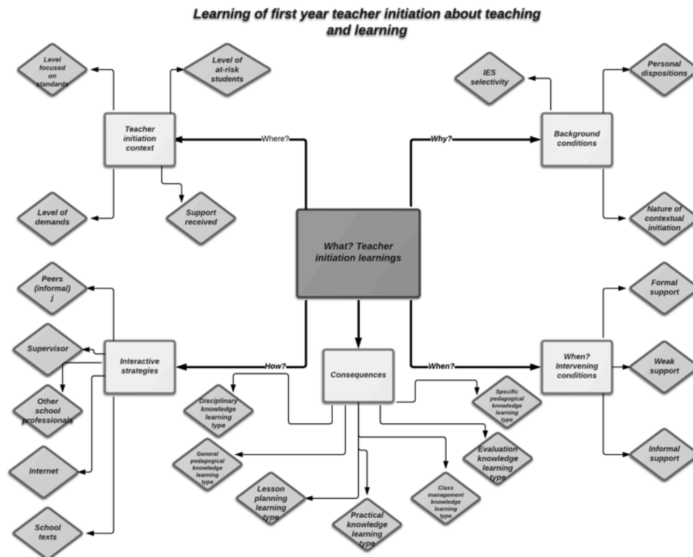
Figure 1. Learning of first year teacher initiation about teaching and learning.

The analysis according to selectivity of the formative program and initiation context suggests that the first year of teaching learnings reported are mediated by the context of initiation, by background conditions, and conditions involved.